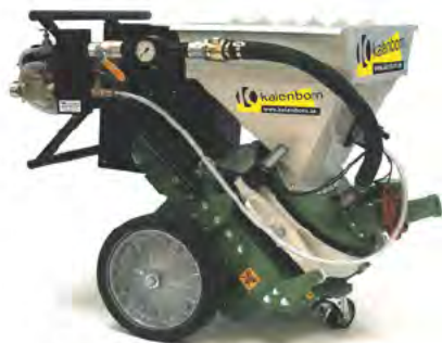
KALCRET®-S spray system